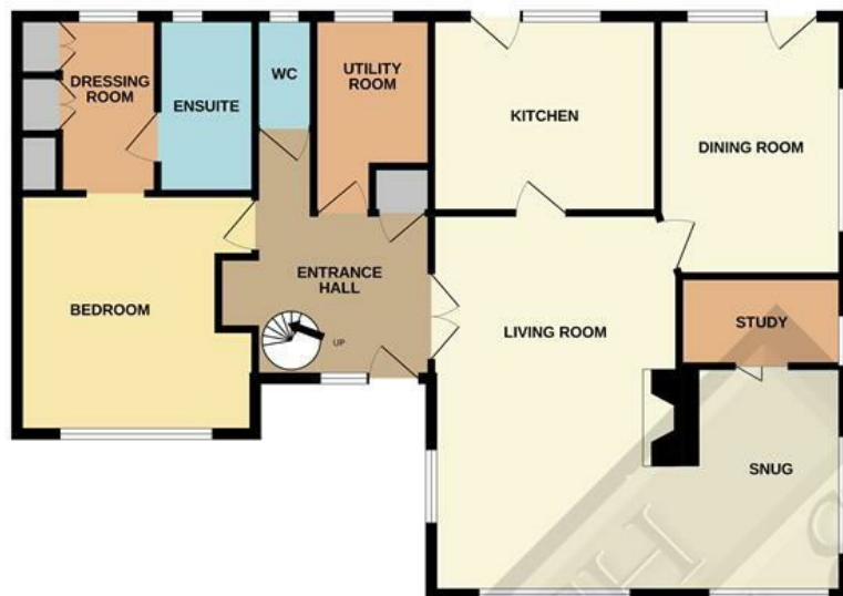
GROUND FLOOR 1022 sq ft. (94.9 sq.m.) approx.