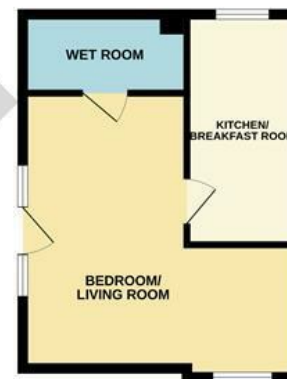
ANNEX 309 sq ft. (28.7 sq.m.) approx.